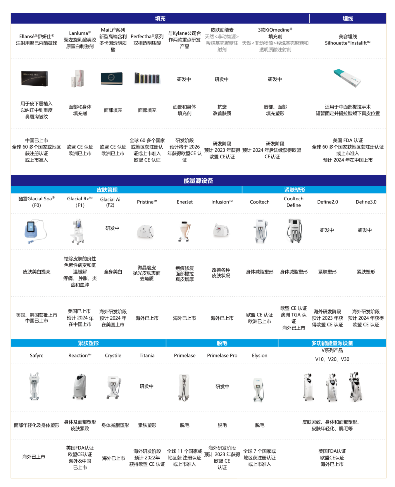
The Company's aesthetic medicine products that went to market or under R&D